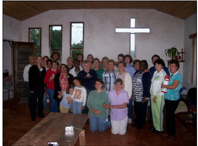
In June 2006, a joint companion synod delegation of women from Nebraska and Tanzania visited the IELU and had the opportunity to walk with small farmers in Misiones, seeing agriculture and globalization through their eyes.

An example of a justice approach is ONE: The campaign to make poverty history, a movement that the ELCA and many other churches and humanitarian organizations have joined. 3 The ONE campaign does not ask for members' money but rather for them to raise their voices to world leaders. At the United Nations Millennium Summit in 2000, world leaders agreed to the Millennium Development Goals, a set of measurable goals for fighting poverty, hunger, disease, illiteracy, environmental degradation and discrimination against women. As Christians we can play a key role in building the moral and political will to realize these goals as well as holding our government accountable to its resource and political commitments.