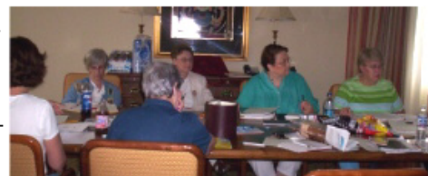
The board plans the 2007 Biennial Convention at Adam's Mark in Indianapolis