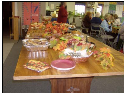
This is the feast—or what’s left after breakfast!